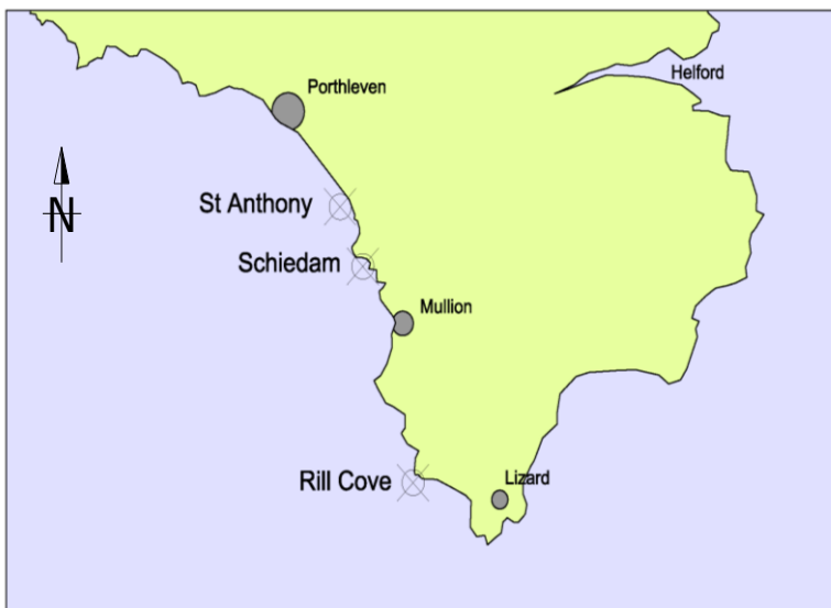
Fig 1. The location of the St Anthony, Schiedam and Rill Cove sites on the west coast of the Lizard peninsula.

The site is situated on the west coast of the Lizard peninsula in west Cornwall. It lies in shallow water a few metres from the cliff face; the centre of the Rill Cove designated area is given on the statutory instrument (designation No 1) 1976 No. 203 as 67751345 on the 6" to 1 mile Ordnance Survey Map, sheet SW 61 SE. The current designated area is a circle, centred on the above position, with a radius of 100m.